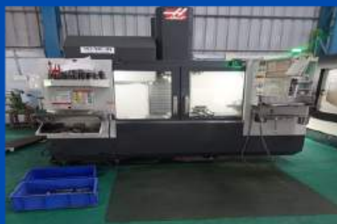
CNC MILLING 4 AXIS