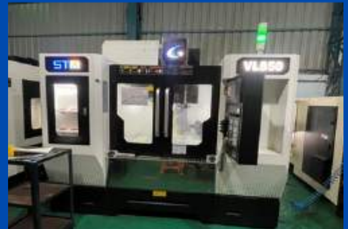
CNC MILLING 4 AXIS