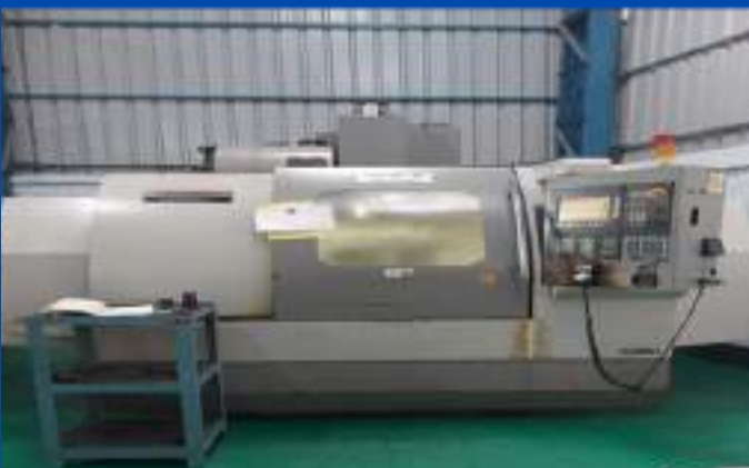
CNC MILLING 4 AXIS