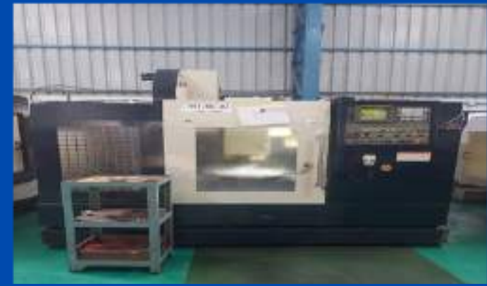
CNC MILLING 3 AXIS