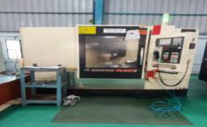
CNC MILLING 4 AXIS