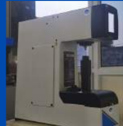
HARDNESS TEST MACHINE