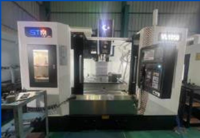
CNC MILLING 5 AXIS